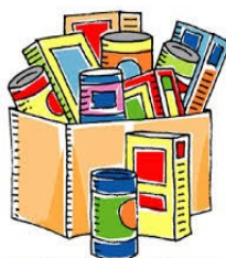
Feeding the Community

During the Prelude on the 7th the youth invite you to bring your food pantry items to the front of the Sanctuary. Monetary donations should be made out to the FOC Food Pantry. The youth will be delivering the items later that day.